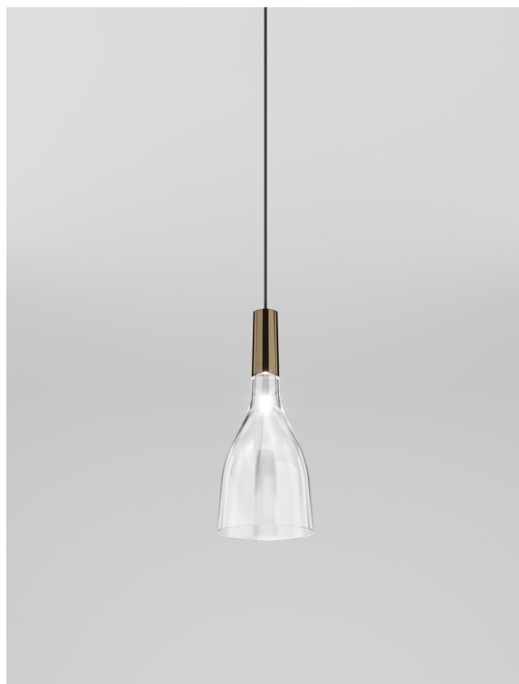
SCINT SP CRTR BH L22 11 CE